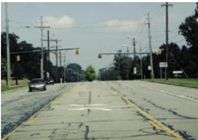
Traffic Maintenance Design