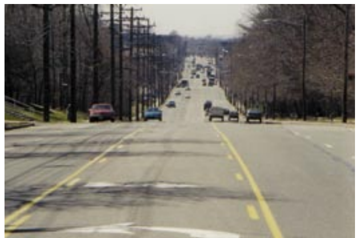
Major Roadway Design