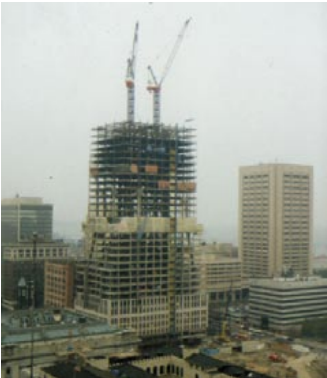
Heavy Construction Surveys