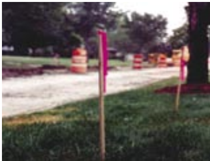
Highway/Road Construction Surveys